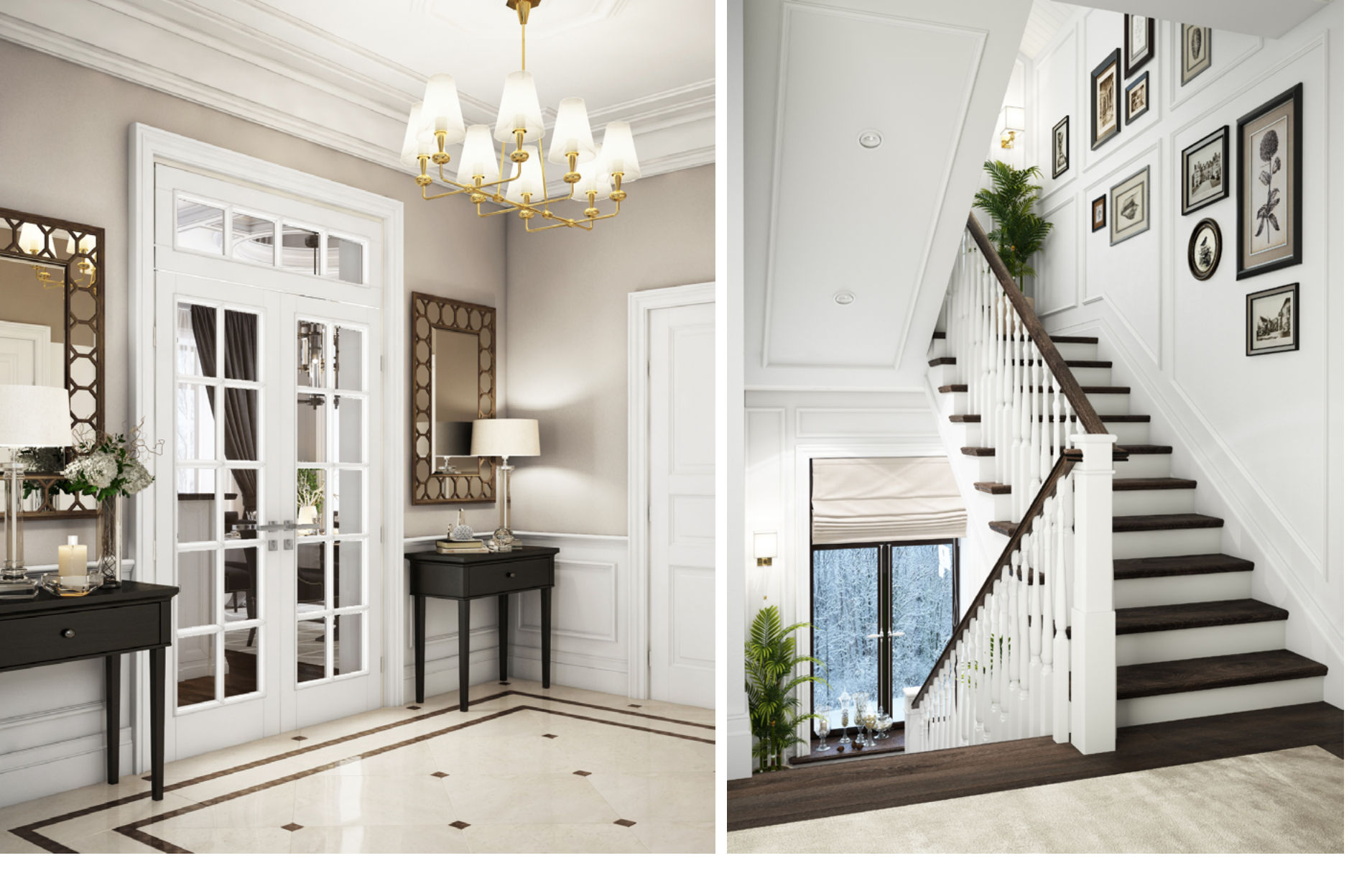
We love and respect both traditional and contemporary styles. And what style do you have inside?