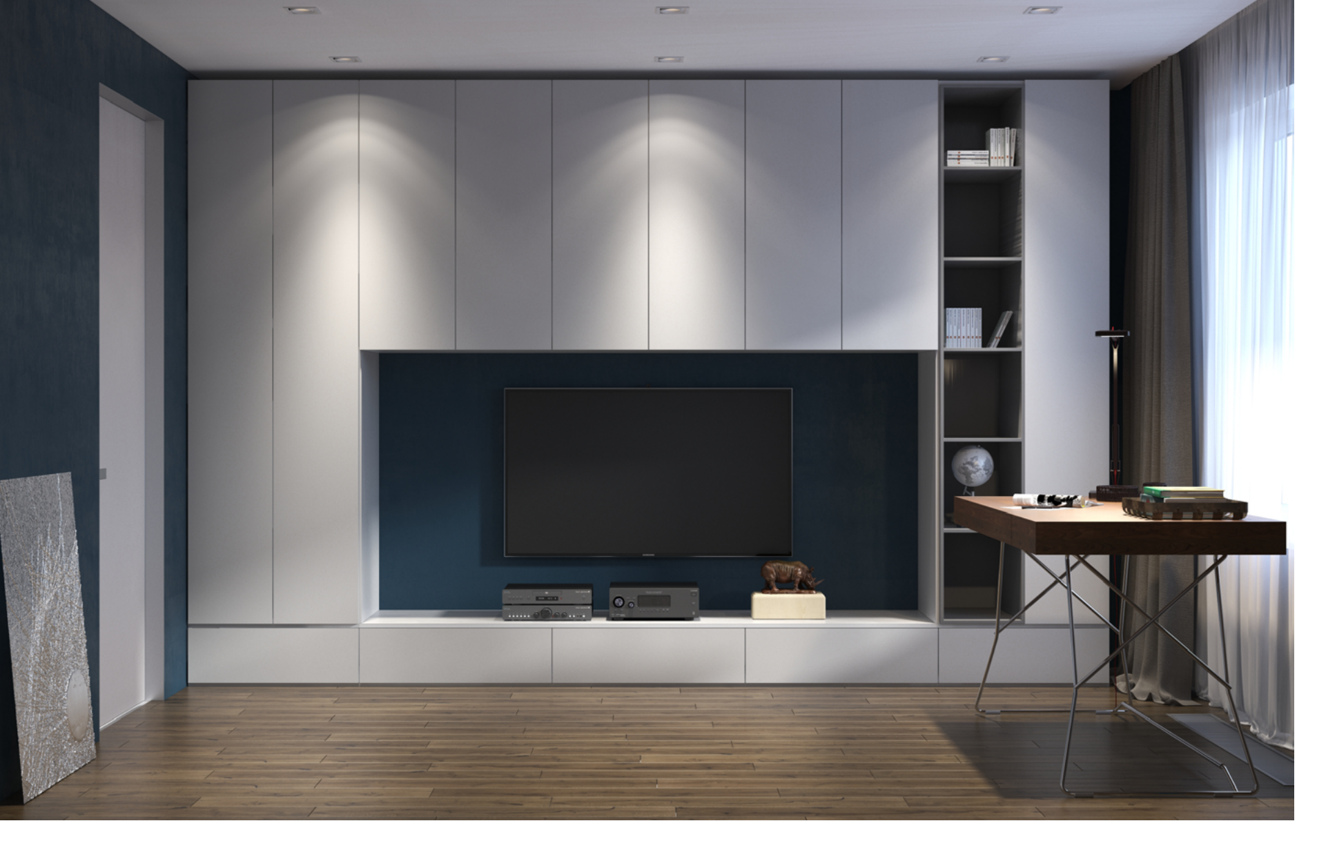
A design project — from the idea, 3D visualization to the blueprints for implementation.